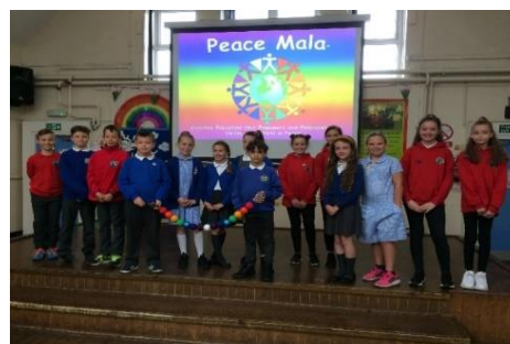
Some Year 6 Catwg pupils join Peace Mala friends from Central Primary School on stage at Central's celebration of their Peace Mala's award – June 2019