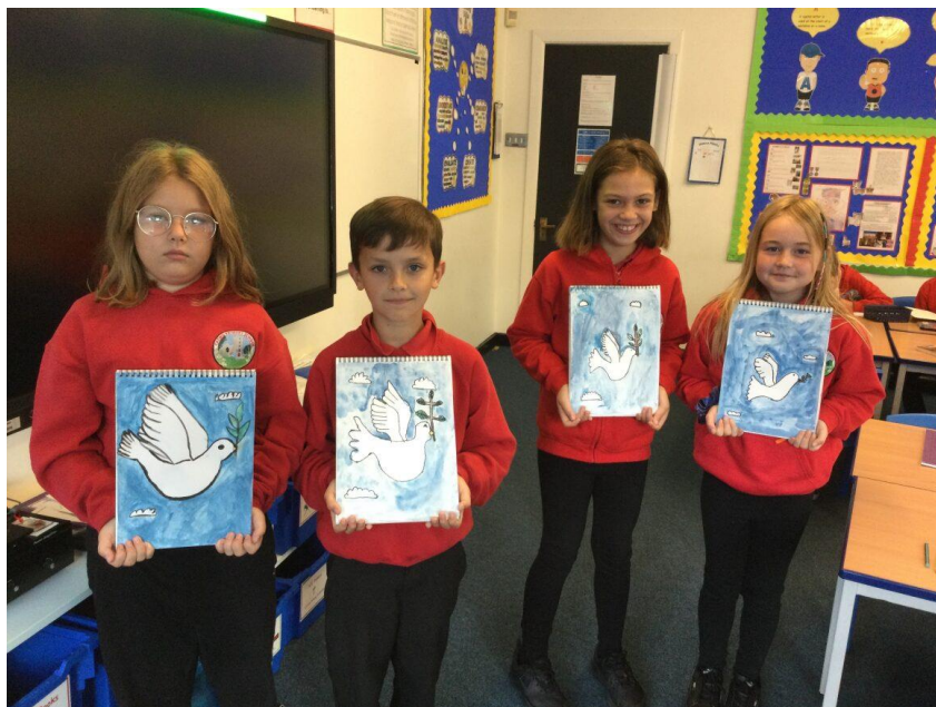
Year 4 pupils with their artwork – “Peace” Spring 2022.