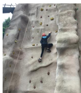
Year 6 enjoying a range of adventurous activities at Manor Park Residential.