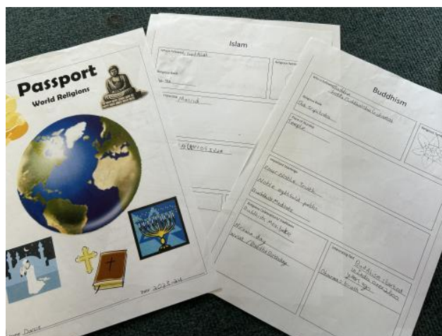
Year 5 multi faiths passport