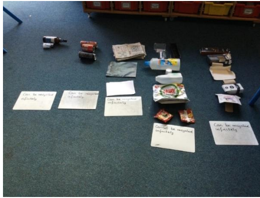
Graph following Eco Workshop on Litter