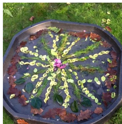
Rangolis using natural materials from our school grounds