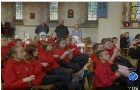
Year 6 sign and sing the Peace Mala anthem "One light" at St Mary's Church, Swansea – September 2022.

Catwg submitted work on Area 6: Environmental Sustainability, healthy eating, respect for animals & wildlife for the Peace Mala exhibition at Swansea Museum – July 2023.