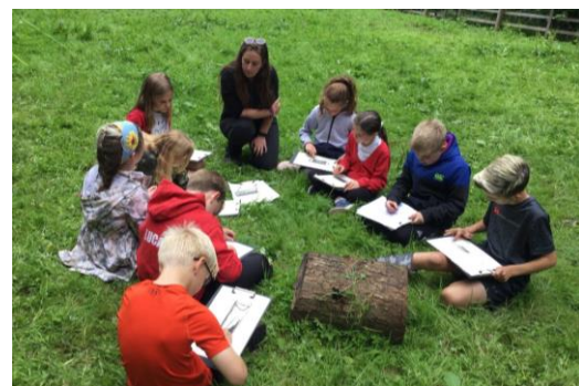
Preparing willow for making charcoal and using the charcoal for art work