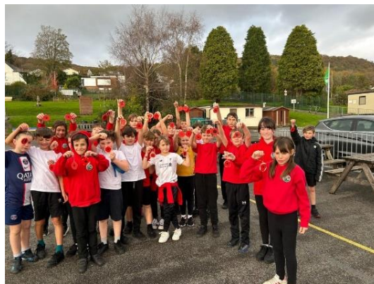
Year 5 Remembrance poppies.