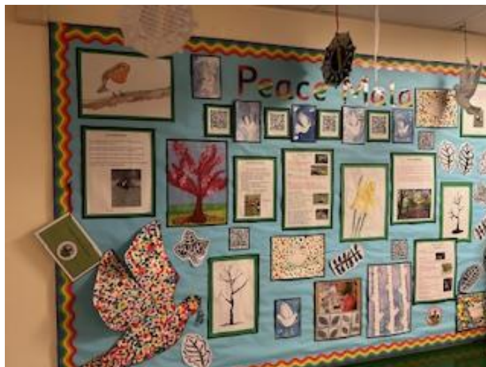
Our Peace Mala notice board, located in the school foyer