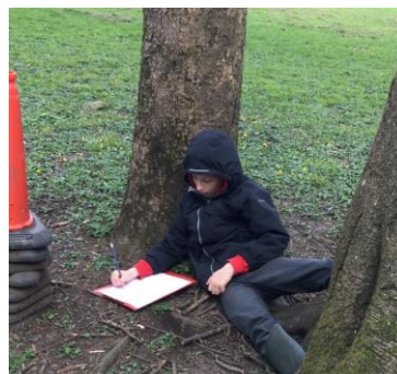
Finding their “special place” to write about – follow up to Eco workshop