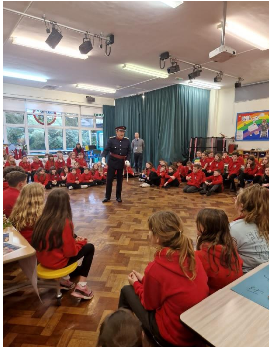
Lord Lieutenant of West Glamorgan opened our enterprise afternoon.