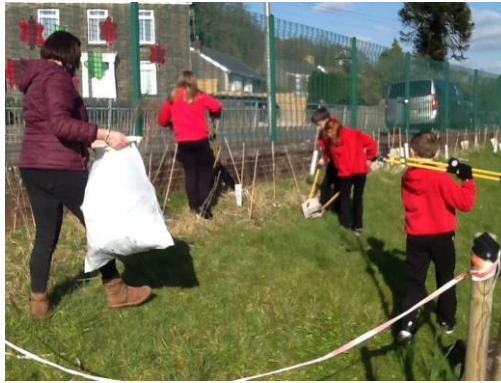
Litter picking in our school grounds