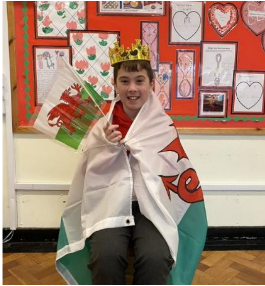
Our bard – 2022