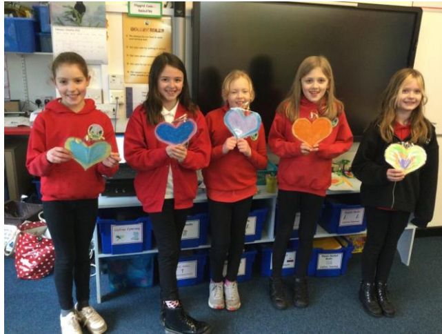
Year 4 write acrostic poems on "Friendship" to celebrate Valentine's Day.