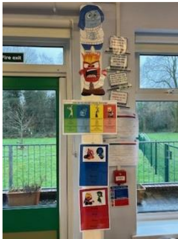
Zones of regulation displayed in classrooms.