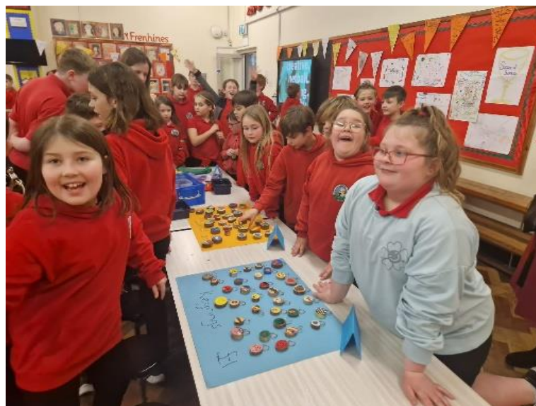
One of our stalls at our enterprise fayre – March 2023