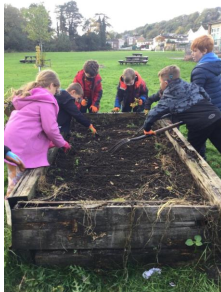
Harvesting and preparing our vegetable allotments