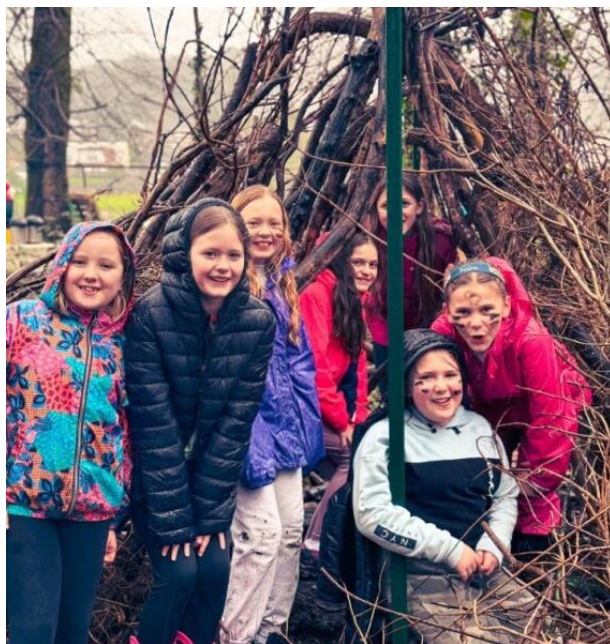
Year 6 pupils enjoying their Forest Schools session