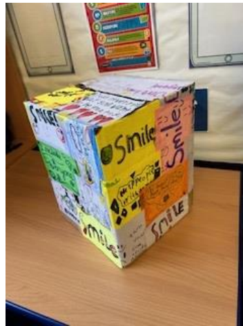
Year 5's class kindness box.

Thank you for completing your Accreditation Self-Evaluation Form! As soon as we receive this it will be sent to our Board of Trustees and Educational Advisors for approval. We look forward to you joining our growing family of Peace Mala Accredited Schools.