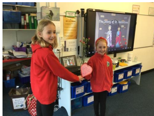
Year 6 deliver Peace flowers and messages to every class on Valentine's Day