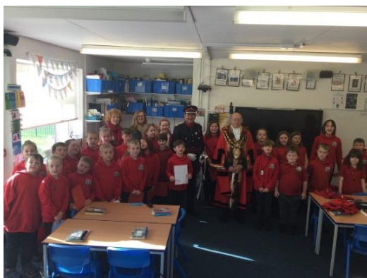
Year 4 Remembrance poetry.