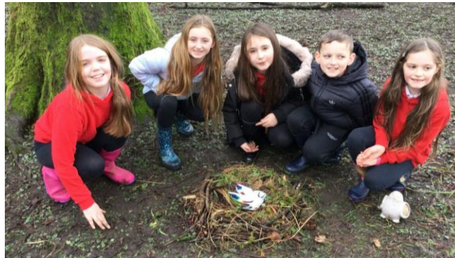
Making bird nests as follow up to Eco School’s workshop